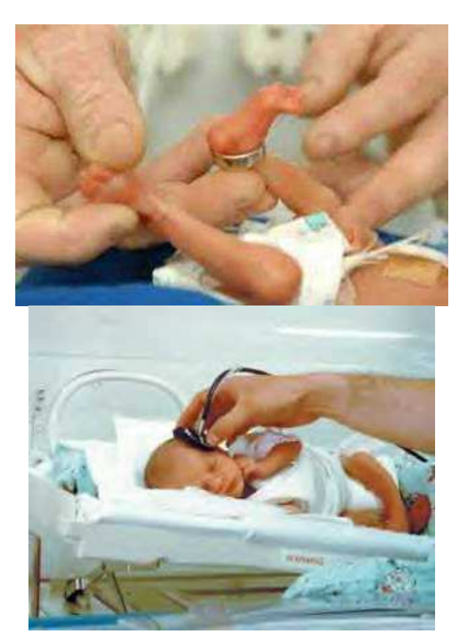
But as the weeks went by,

There was never a moment when Dana suddenly grew stronger.