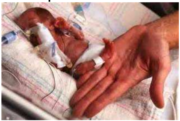
Still, the doctor's soft words dropped like bombs.

"I don't think she's going to make it," he said, as kindly as he could.