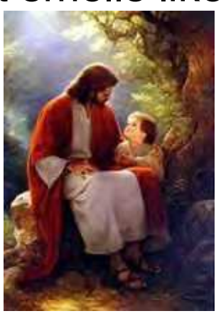
announced, "No, it smells like Him.

It smells like God when you lay your head on His chest."